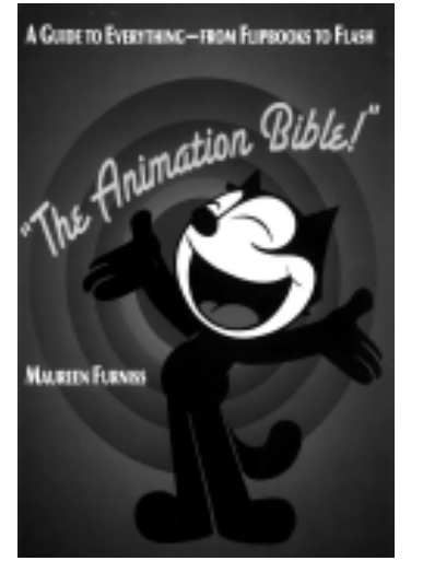
Animation Art Anthology Charles Abrams, NY Laurence King, London