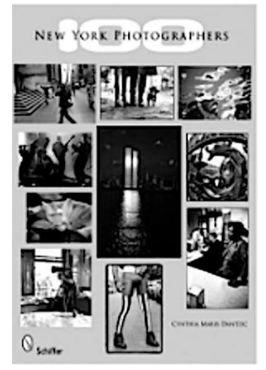
Rizzoli Booksellers, NY Photography Anthology Schiffer Press Rizzoli Books